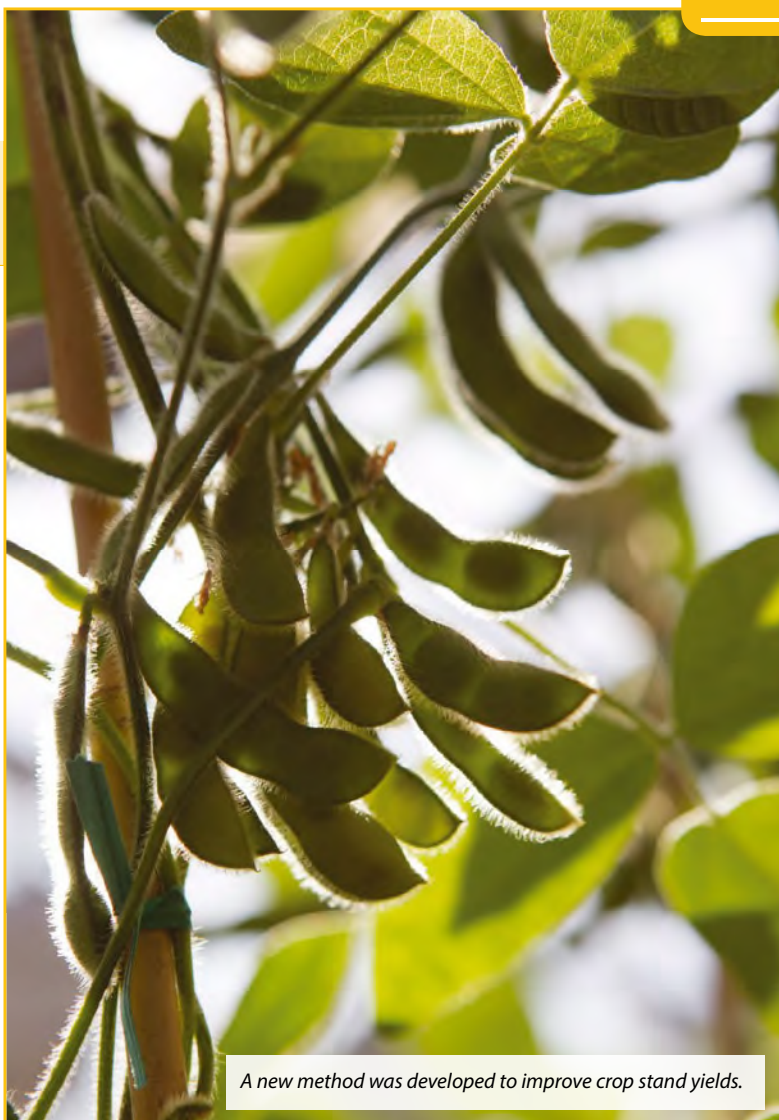
A new method was developed to improve crop stand yields.

In discerning the problem at hand, we are left with no alternative but to quantify what we can and determine